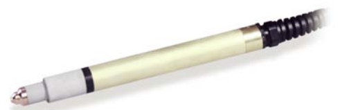
T100M machine torch