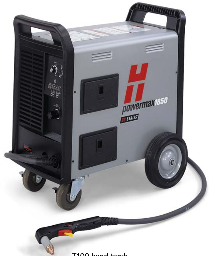
T100 hand torch